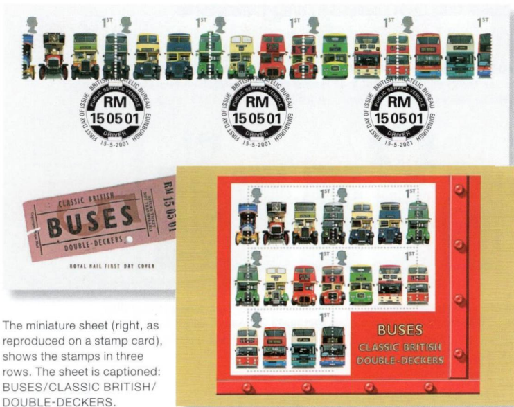
The miniature sheet (right, as reproduced on a stamp card), shows the stamps in three rows. The sheet is captioned: BUSES/CLASSIC BRITISH/DOUBLE-DECKERS.

Other handstamps for 15 May will be announced in the British Postmark Bulletin , available on subscription from Royal Mail Tallents House, 21 South Gyle Crescent, Edinburgh EH12 9PB (£10 UK/Europe; £21.75 elsewhere).